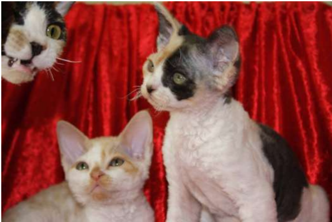
Photo: 2 kittens from Db.Gr.Ch.Astracan Candy Floss and Ch Astracan Armani, look out for these babies this show season.

Db.Gd.Ch. Astracan Candy Floss Won best entire Devon Rex for 2011, also reserve country owned exhibit for 2011. Ch Astracan Kirlee Temple won reserve best Devon Rex entire for 2011, also group 3 Debutante of the year 2011. Gd.Pr.Astracan Toblerone won best Devon Rex neuter for 2011.